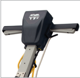
Simple To Use Operator Handle