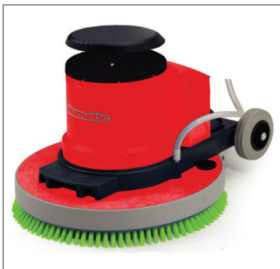
Optional Hi-Dust Filter