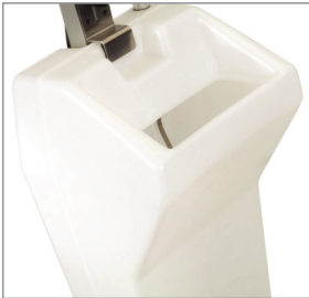
Large Solution Tank