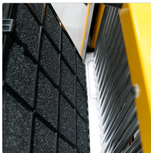
Compact foam air filter enables work in very dusty spaces