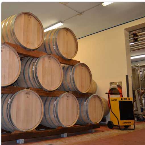
Master DH wine production