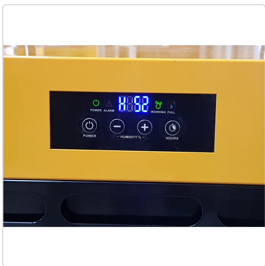
Digital control panel