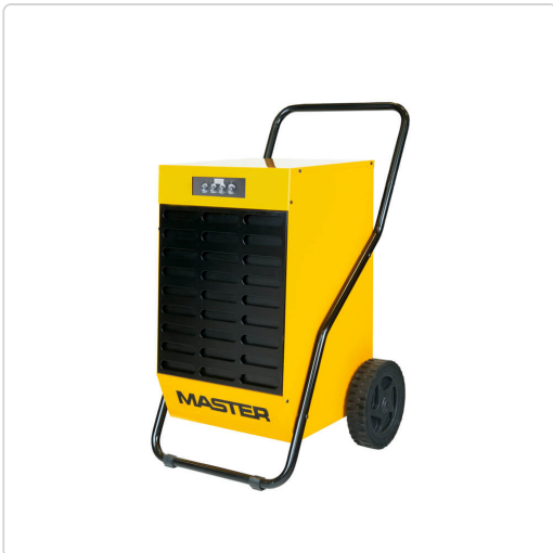
Master DH 44

Highly efficient machines designed to operate in harsh work conditions. Ideal for industry and construction. Sturdy and cost-effective range of portable dehumidifiers ideally suited for projects in the construction industry, restoration jobs, water damage control and more.