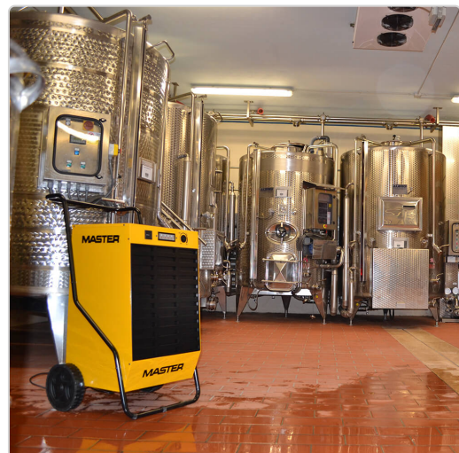
Master DH wine production