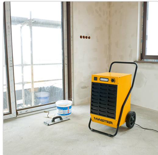
Master DH 44 restoration